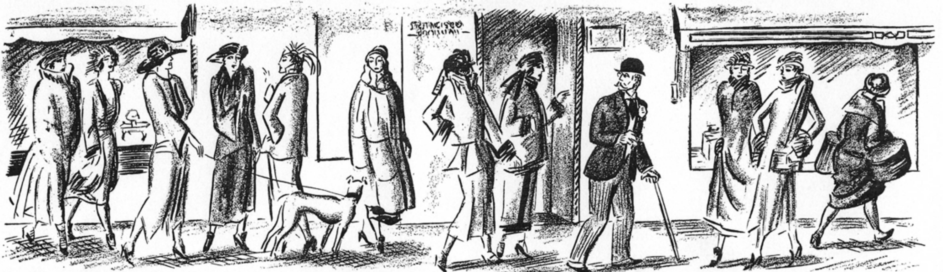
FIFTH AVENUE AT FORTY-EIGHTH STREET, WHICH IS THE HAUNT OF THE MILLINERS AND MIDINETTES