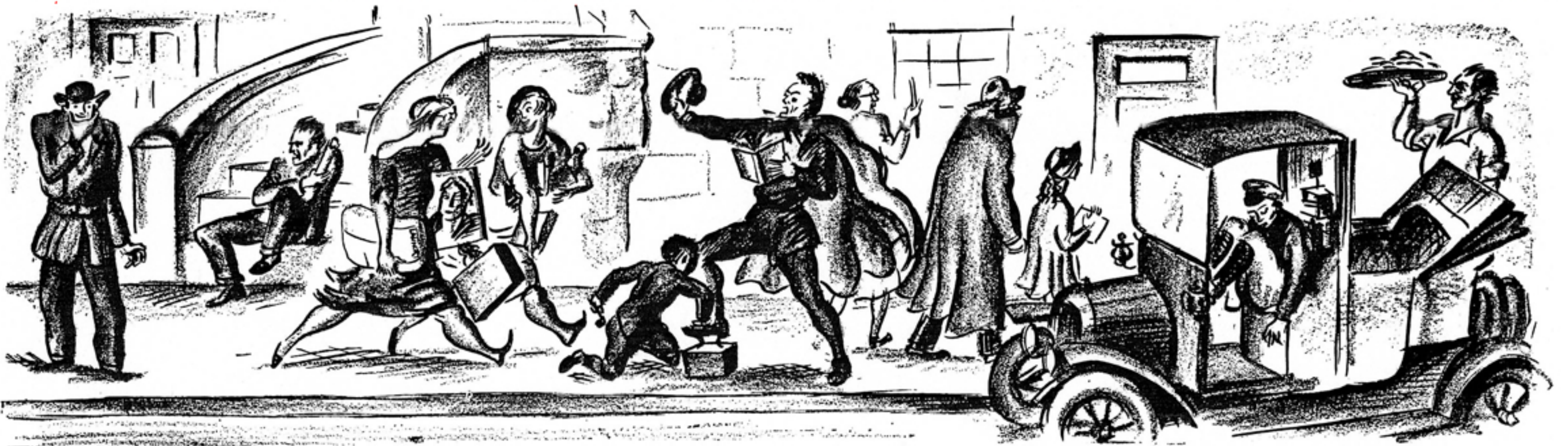
FIFTH AVENUE AT EIGHTH STREET, THE DISTRICT OF BATIKS, ART STUDENTS, TEA-ROOMS, AND FREE VERSE POETS

The thing which makes Fifth Avenue so extraordinary among the famous streets of the world is that it presents a new aspect every half mile or so. Where the Rue de la Paix and Piccadilly preserve their identity throughout, Fifth Avenue shows almost every phase of New York life within a few miles